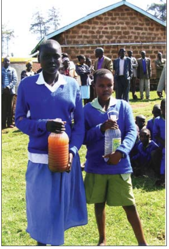
Two children at Kipsiwon Primary School in Kenya demonstrate the difference between the water formerly drawn from a stream and that now available through a rainwater holding tank.

ful for your generosity over the years that has made possible improved drinking water supplies for tens of thousands of people around the world.