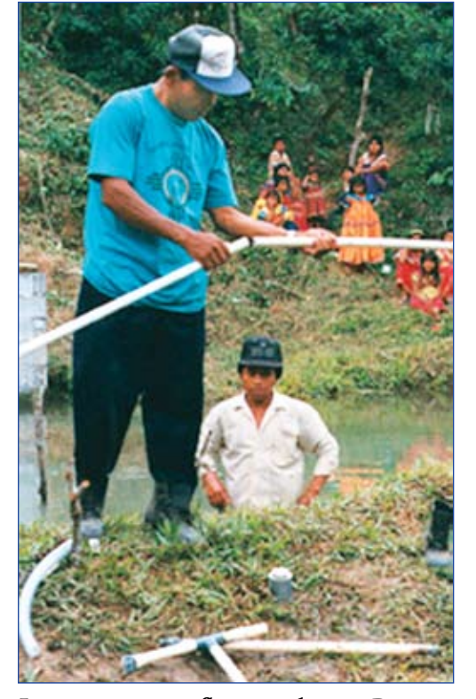
Laying a gravity-flow pipeline in Panama

Every penny gets put into bags of cement and PVC tubing as Peace Corps organizational costs are already