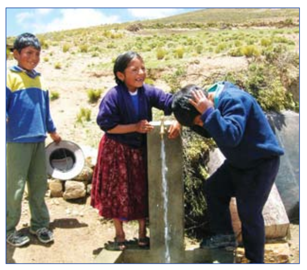
Children celebrating clean water in Bolivia.

ntil 2005, no U.S. organization existed to advocate full-time on behalf